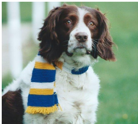
Picture of Ben the Dog in his away scarf at Hadleigh United circa 1999.

If we could consistently serve up the level of football the side produced in our last home game, then I think our average gate would be pushing up around that 400 mark sooner rather than later!