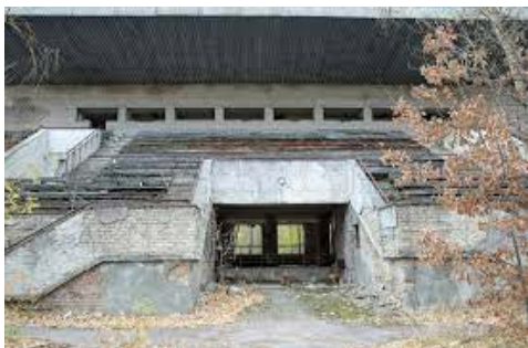
AVANHARD STADIUM TUNNEL

who would later enter the Ukrainian Hall of Fame. By 1979, the power plant was completed and operational, but the builders stayed, this time building their lives in Pripjat, and continued playing for and supporting Stroitel.